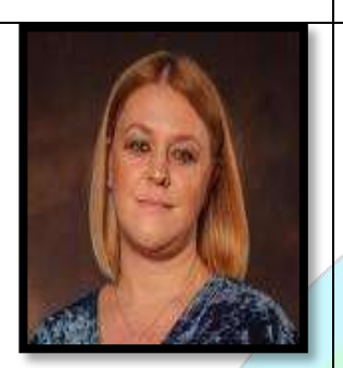
Brisida Shera ERCICRLSH2115056

Herein, a simple and sensitivemethod to study the electrochemical behavior of transferred electrons through theinterdigitated electrodes (IDEs) for different constructed biosensors by utilizing the electrochemical impedance spectroscopy (EIS). A three-dimensional multifunctional hydrogel interconnected network of water soluble cobalt phthalocyanine (CoPc) in single-layer graphene nanoplatelets (SLGNPs) as non-enzymatic biosensor(GnP-CoPc-SLGNPs/PANI-MFH) has been reported. The fabricated biosensing platforms have been tested to estimate the effective number of electrons during the electrochemical reactions. Structural and morphological studies of the formed hydrogel (PAA-CP/GPL-CoPc-CH) were carried out using scanning electron microscopy (SEM), Fourier-Transform Infrared (FTIR), transmission electron microscopy, (TEM), X-ray diffraction (XRD), and UV-Visible absorption spectroscopy. The electrical conductivity of the detection electrode was studied using electrochemical impedance spectroscopy (EIS) measurements. The enhancement in the electron transfer activity of the modified electrodes will develop the sensitivity of biosensors for biomolecules species detection.